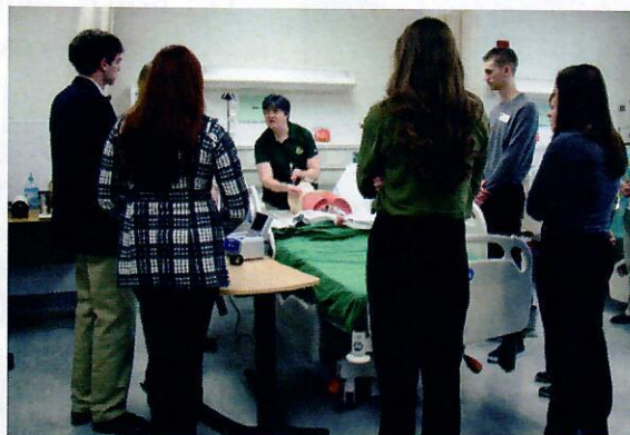
Touring Missouri Southern State University's Health Science Building on Health Care Day.

Application forms are attached or are available at the school's guidance office and must be returned to your counselor by September 21, 2015.